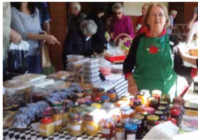
MALENY GARDEN CLUB PRODUCE STALL