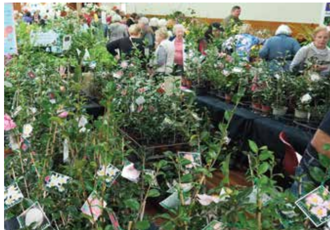
RANGE OF CAMELLIAS FOR SALE

Teas & Lunches at Pavilion • TICKETS - CASH ONLY No ATM at Showgrounds • No pets in Pavilion Public Toilets - see map • NO TOILETS AT GARDENS